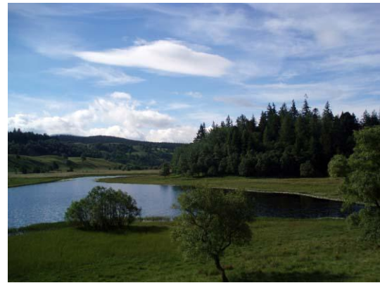
Kettle holes filled with lochans