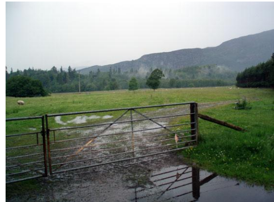
Parkland at Truim house