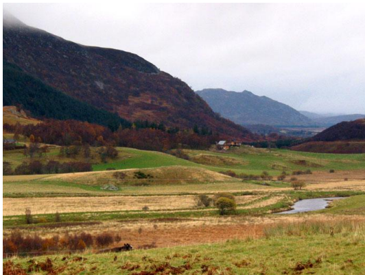
The 'pinch point' seen from Laggan strath – the floor of the strath becomes more hummocky as it extends east towards the pinchpoint

The sense of a 'pinchpoint' is overwhelming, with tall trees reinforcing the enclosure created by the topography. Every element has a clear link with the landform or topography – fields on level land, lochans contained by sinuous terraces, woodland located on steeper slopes, settlement sited on elevated hillocks – all of which create a unified landscape character.