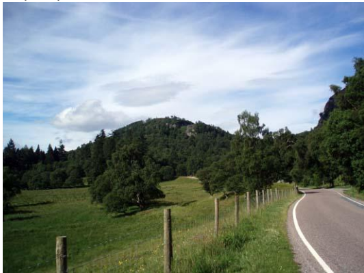
Rocky hills and crags create dramatic enclosure