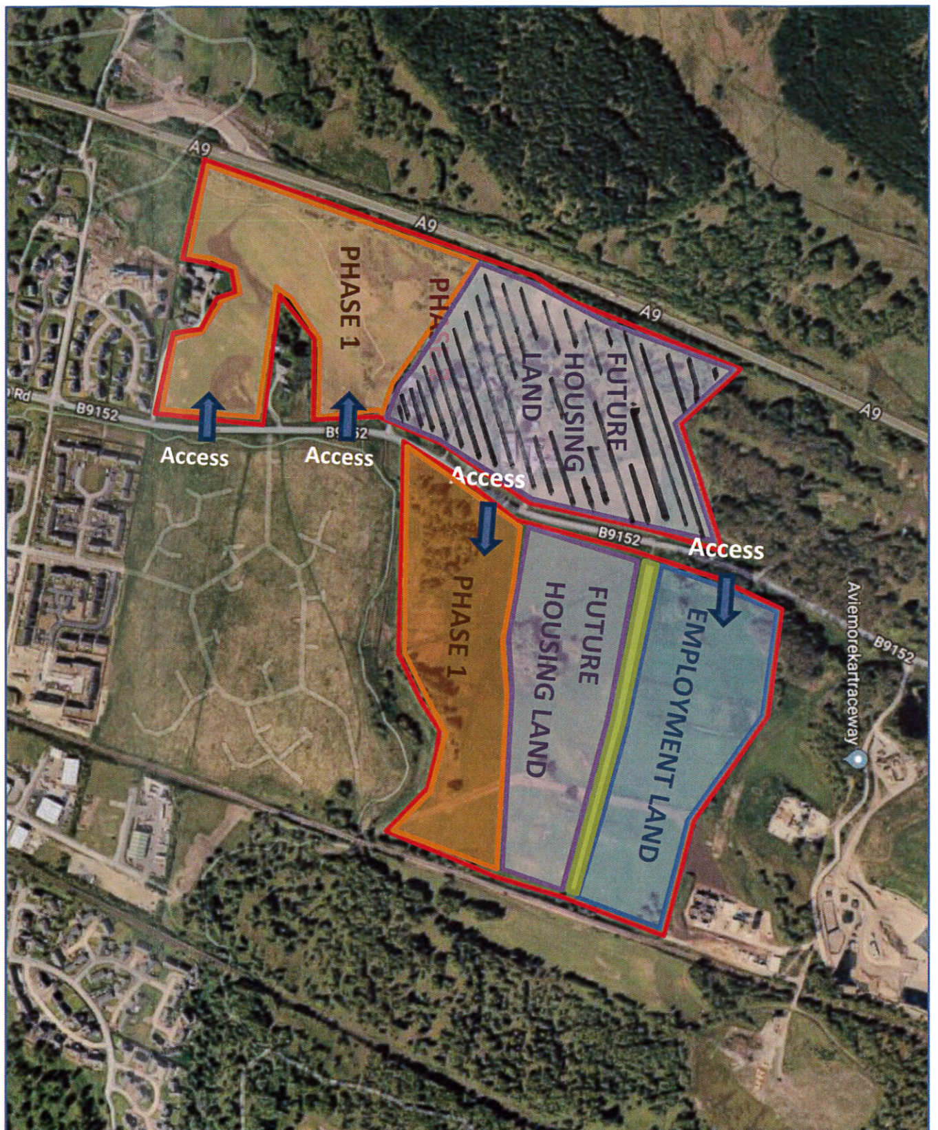
Indicative Phasing Diagram, map © Googlemaps