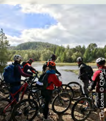
Lily Lochan © CNPA

On foot, by bike, canoe and even horse back, the Cairngorms National Park is a great place to enjoy the outdoors.