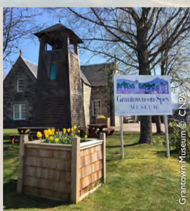
Grantown Museum

There are year round activities and visitor attractions in the Park for everyone. See below for more details.