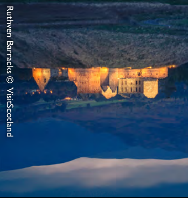
Ruthven Barracks

There is a rich cultural heritage to discover. Did you know that Ruthven Barracks was the site of a castle used as a stronghold by the Wolf of Badenoch?