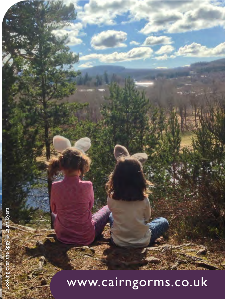
Looking over the Spey