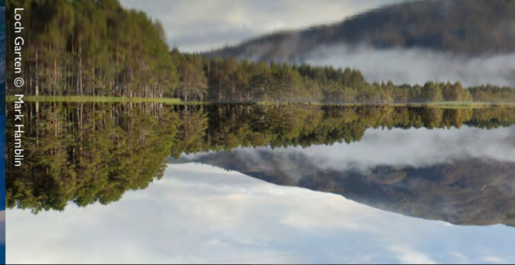
Loch Garten