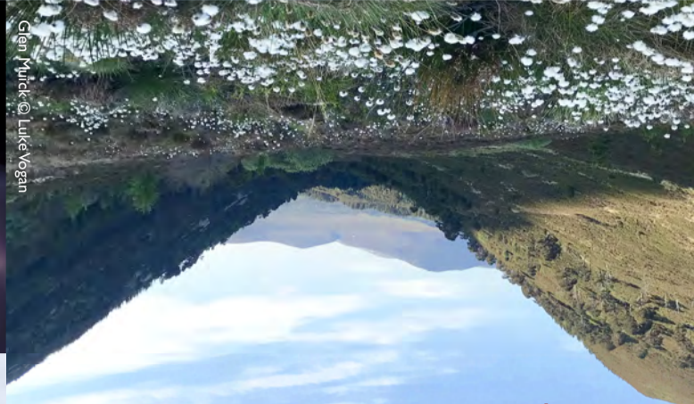
Glenn Quirk

100 COUNTRIES HAVE NATIONAL PARKS CAIRNGORMS NATIONAL PARK IS THE LARGEST IN THE UK. It is twice the size of the Lake District National Park, and bigger than the whole of Luxembourg. It has Britain's highest and most extensive mountain range, the biggest native forests, spectacularly clean rivers and lochs and miles of moorland & farmland. It really is an OUTSTANDING PLACE.