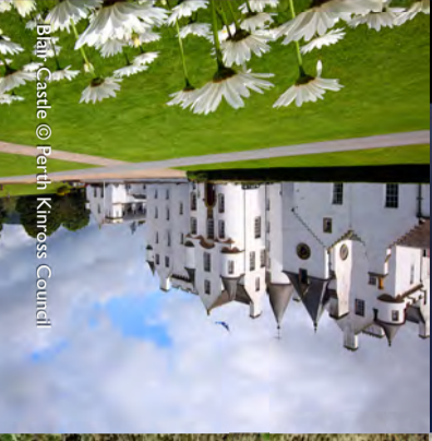
Blair Castle

49% of the Park is of international importance for nature and is protected by European Law. There are 9 National Nature Reserves and 25% of Britain's rare and endangered species live here.