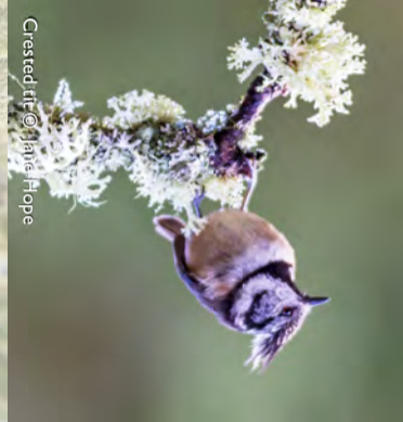
Crested Tit

49% of the Park is of international importance for nature and is protected by European Law. There are 9 National Nature Reserves and 25% of Britain's rare and endangered species live here.