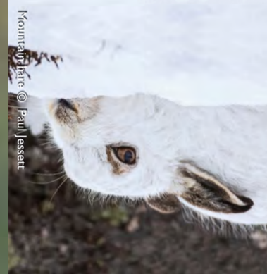
Mountain hare