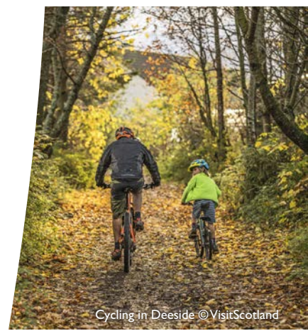
Cycling in Deeside