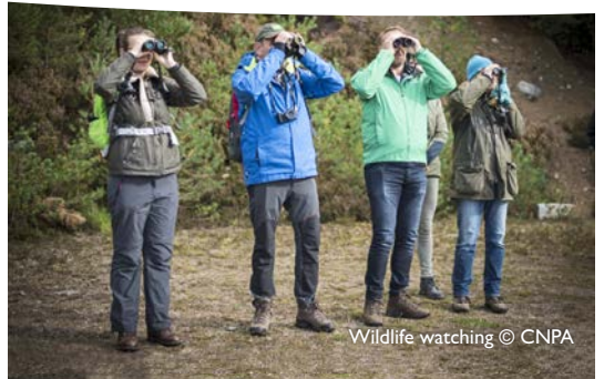
Wildlife watching