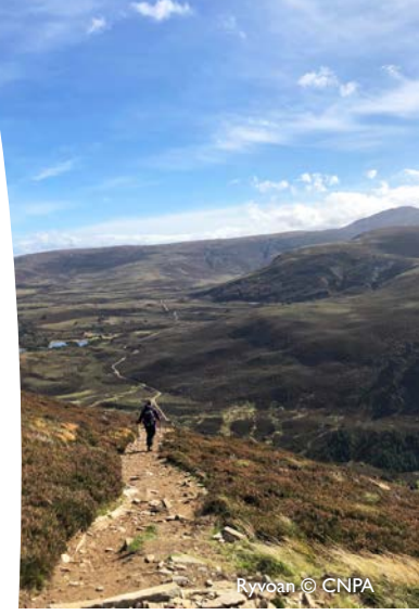
Ryban © CNPA