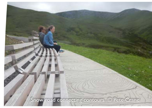
Snow road connecting contours