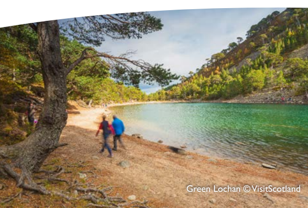
Green Lochan