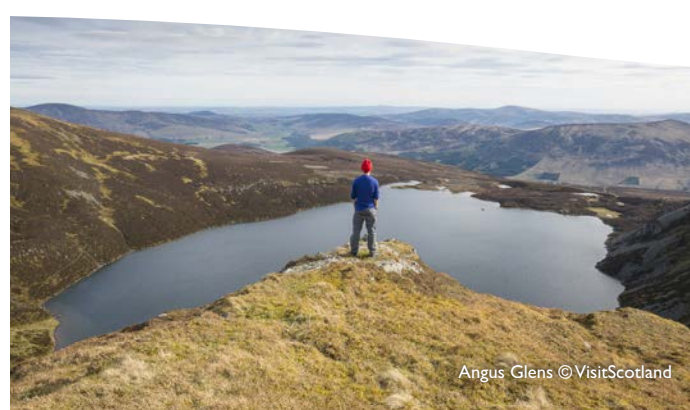
Angus Glens