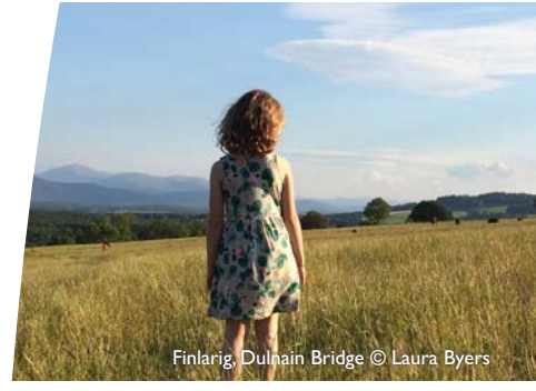
Finlarig, Dulnain Bridge © Laura Byers