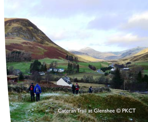
Cateran Trail at Glenshee