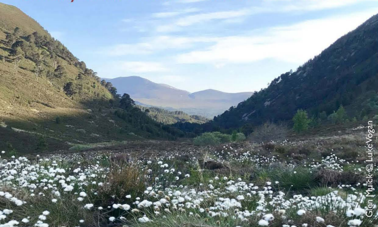
Glen Muick © Luke Vogan