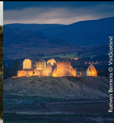
Ruthven Barracks

There is a rich cultural heritage to discover.