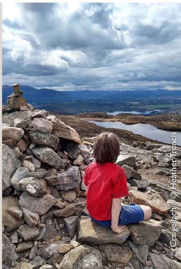
Looking over the Spey

Design by Creative Owl www.creativeowl.co.uk