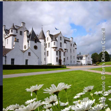
Blair Castle

The Cairngorms National Park has the largest area of native woodland in Britain