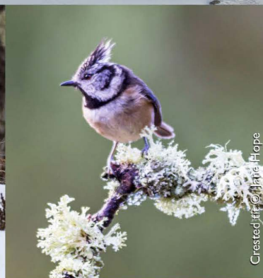
Crested tit

49% of the Park is of international importance for nature and is protected by European Law.