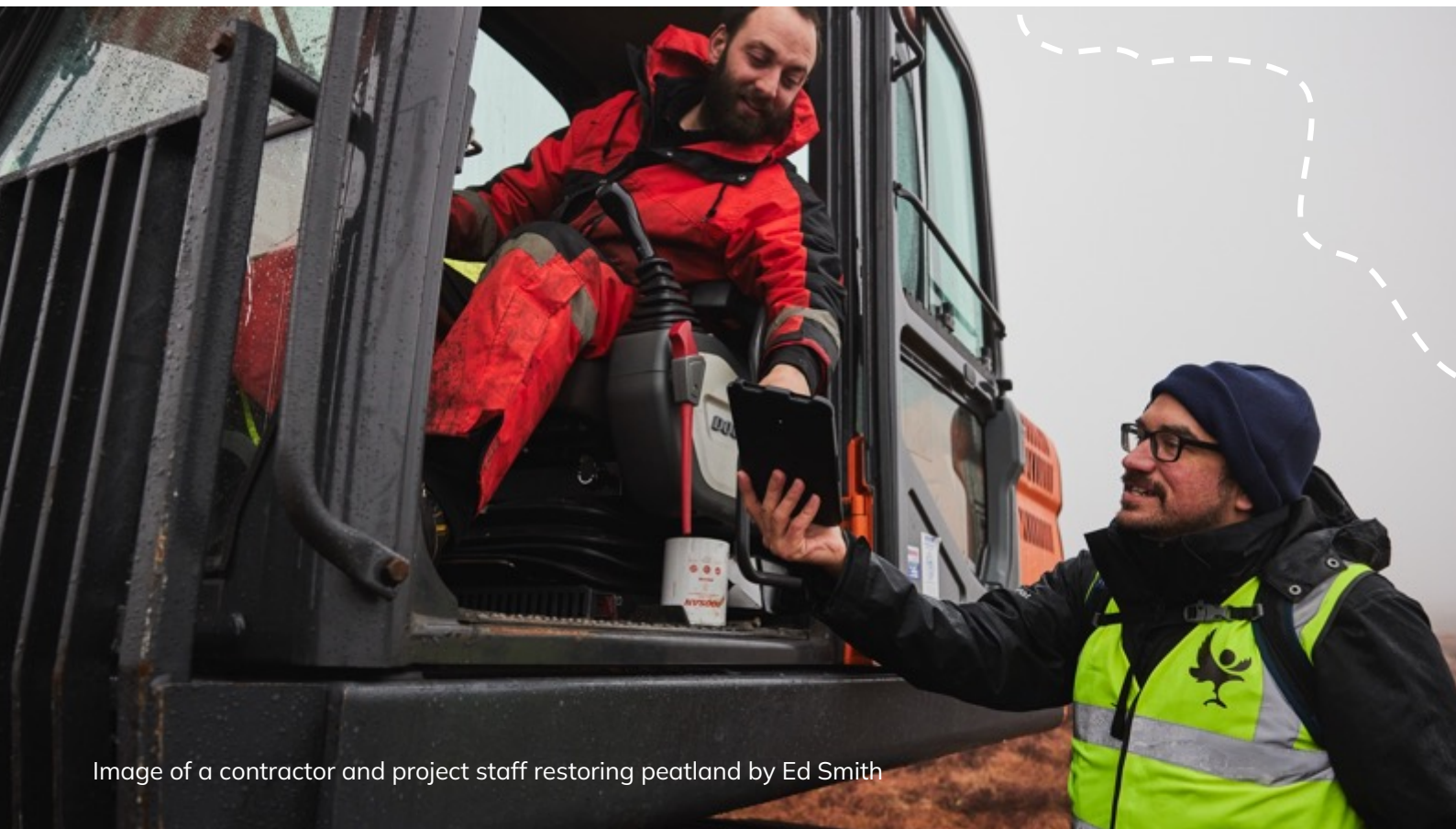
Image of a contractor and project staff restoring peatland