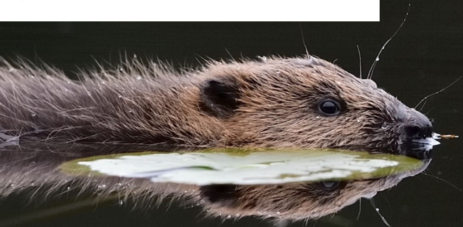
Image of a beaver

As beavers settle into the Cairngorms, they are becoming a symbol of Scotland's bold vision for a wilder, more resilient future. Their presence brings hope that, with the right care and stewardship, we can restore the balance between human activity and the natural world, leaving a lasting legacy for generations to come.