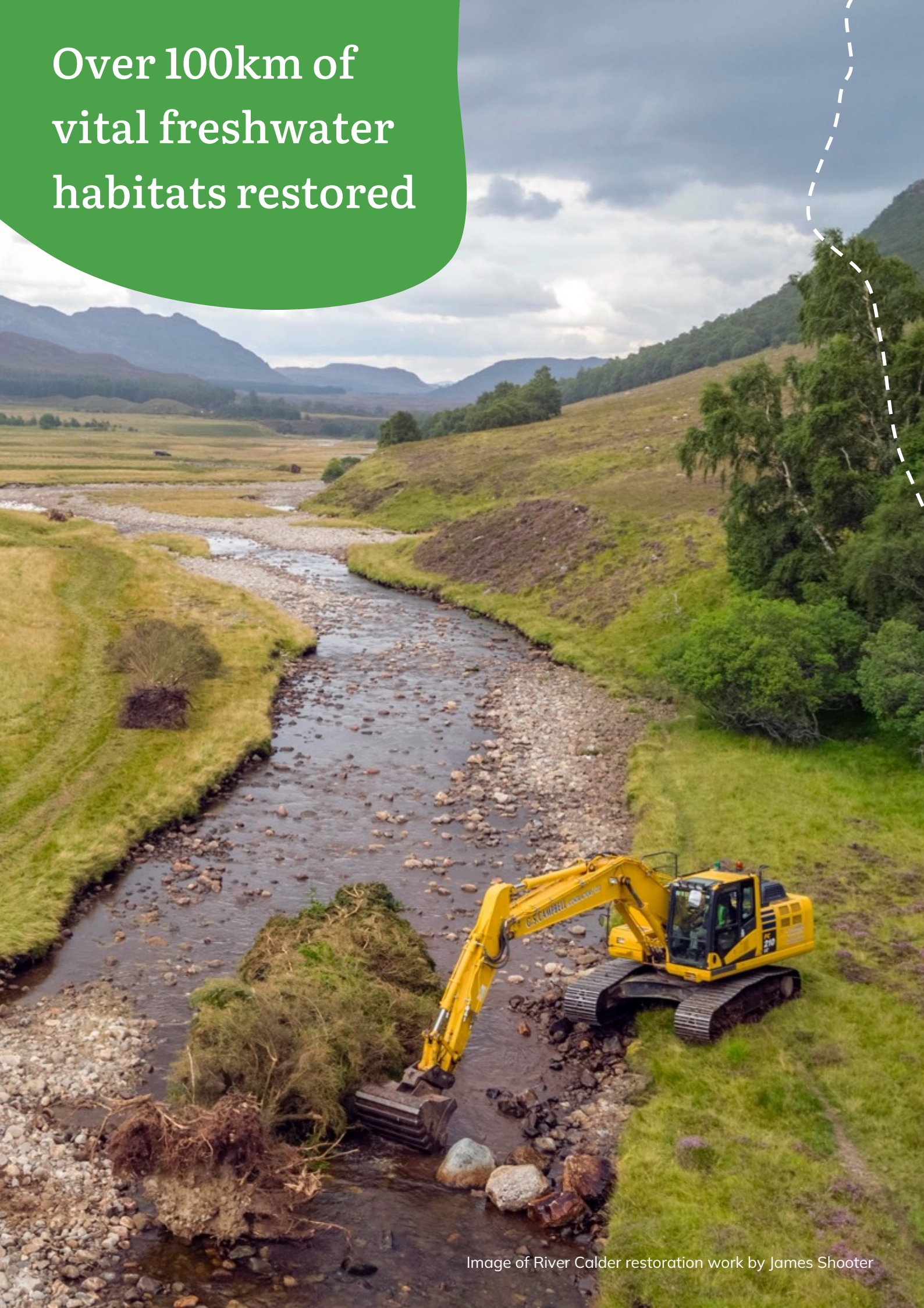
Image of River Calder restoration work

Over 100km of vital freshwater habitats restored