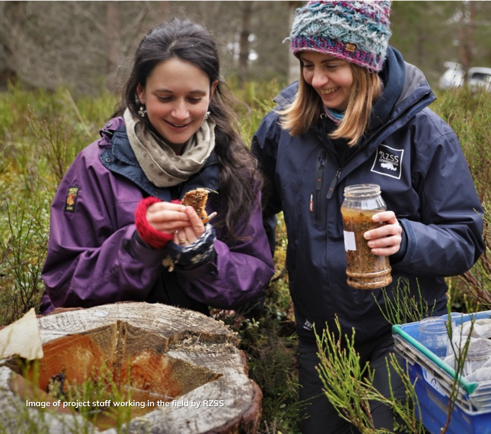
Image of project staff working in the field

The successful delivery of actions in the plan hinged on effective collaboration with a wide range of partners. Evaluating this partnership working - what went well and what could be improved - would help inform the development of the next plan.