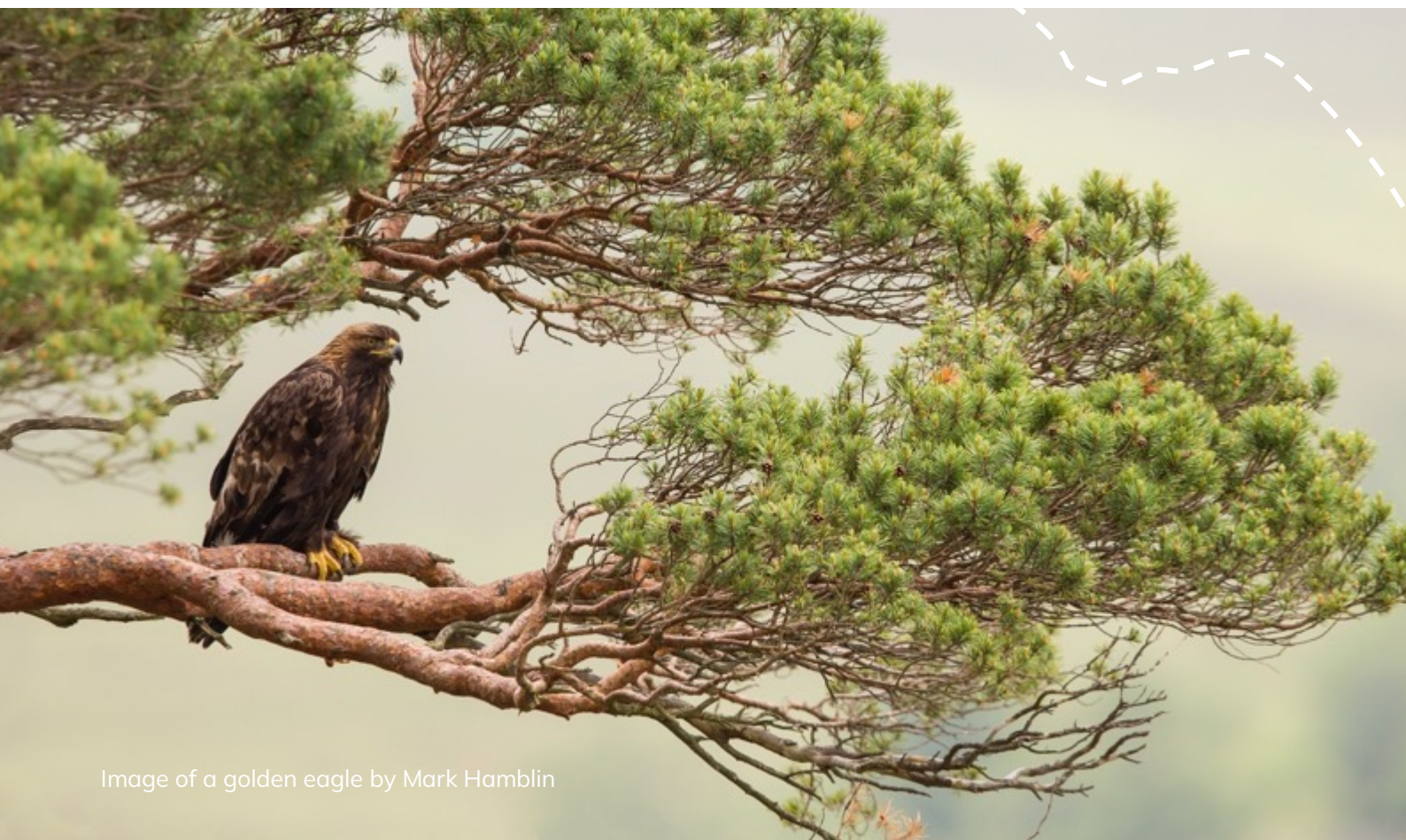
Image of a golden eagle