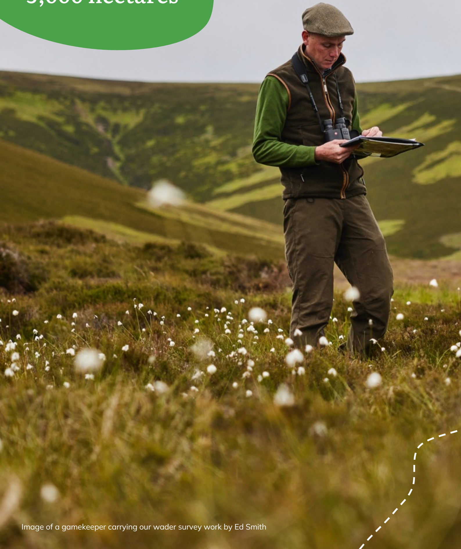
Image of a gamekeeper carrying our wader survey work