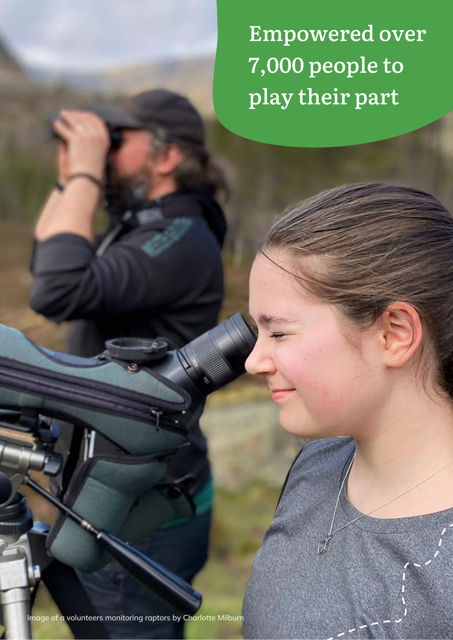
Image of a volunteers monitoring raptors

Empowered over 7,000 people to play their part