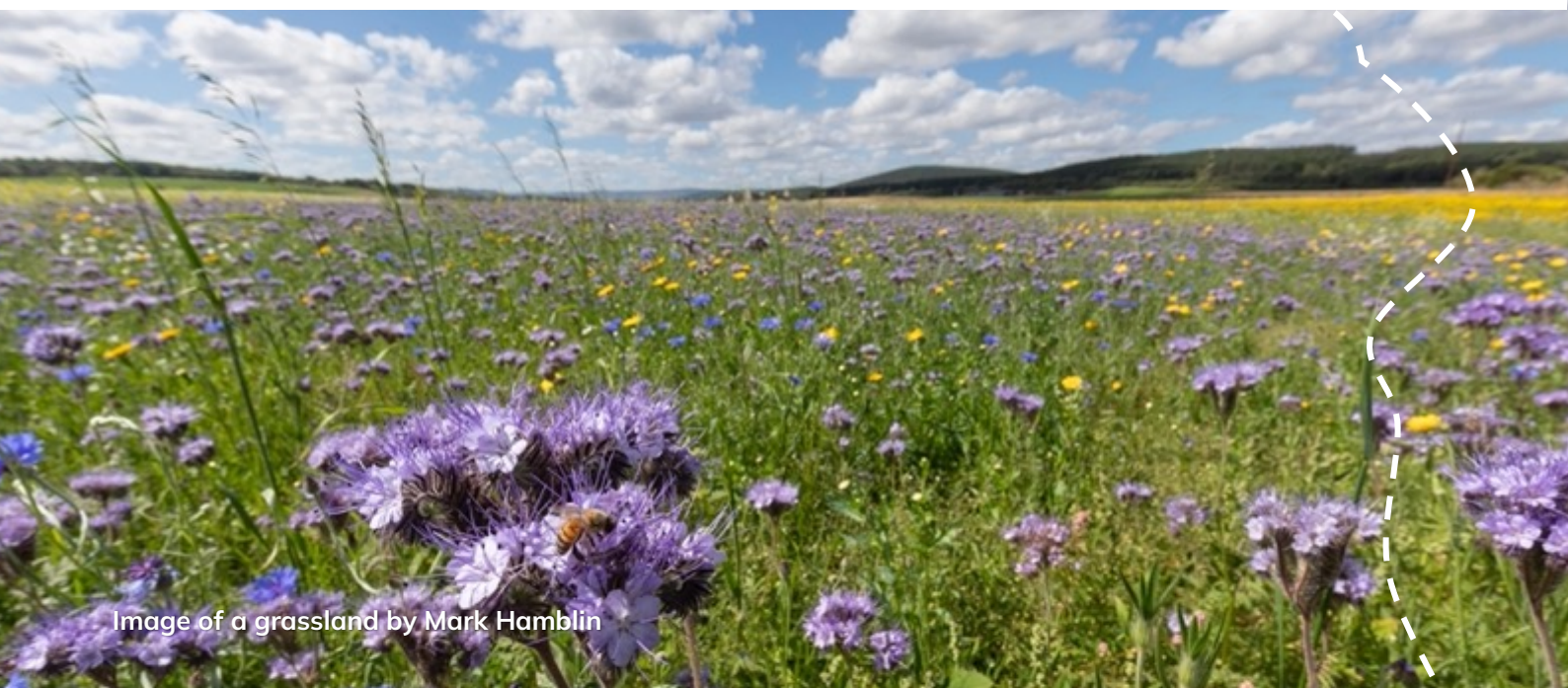
Image of a grassland