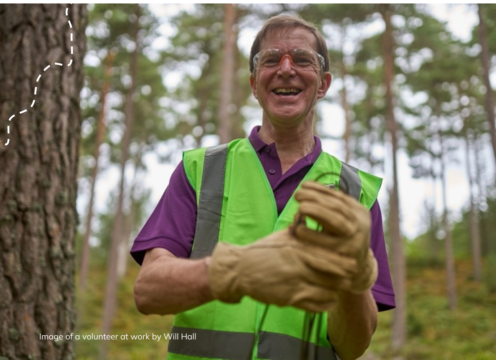
Image of a volunteer at work